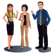
Collaboration between general education teachers and educational specialists

RTI Stands for Really Terrific Instruction