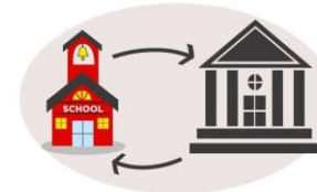
Collaboration between schools and the district office

FAILURE FAILURE FAILURE PREVENTING FAILURE FAILURE FAILURE